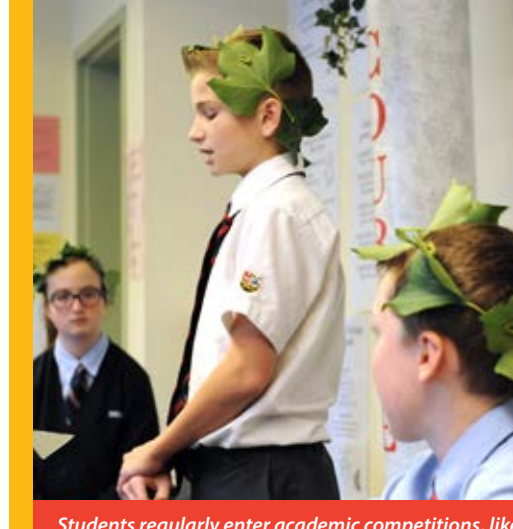
Students regularly enter academic competitions, like Concours d'arts oratoire and mathlete challenges