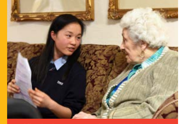
Middle School encourages students to think about the impact they can make on their community and the world

Supporting this approach is teacher collaboration. The traditional subject barriers do not apply well to the real world, so teachers work in crossdisciplinary teams. When students are working on a project, they can do so from different perspectives and with multiple learning opportunities. For example, a project on the Yukon Gold Rush might bring together geography, history, science, drama and technology.