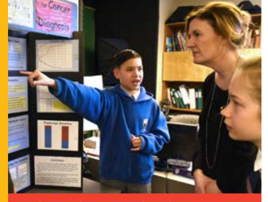
Students work on projects that ask important questions and have real-life relevance