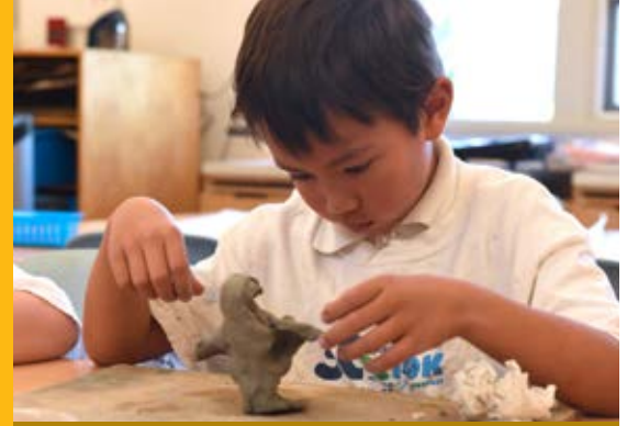
Visual arts is one of many subjects taught by specialist teachers