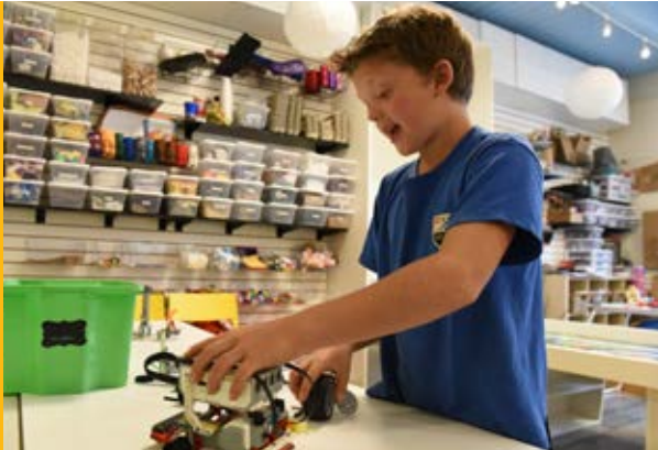
LEGO Robotics is just one of the clubs that supports the academic program

Social and emotional development play just as large a role in success as academic achievement. Through weekly assemblies and in-class lessons, students develop life skills such as learning to make good choices and set goals. See page 9 for more on how we help students build skills, including leadership and service, along with our focus on character education.