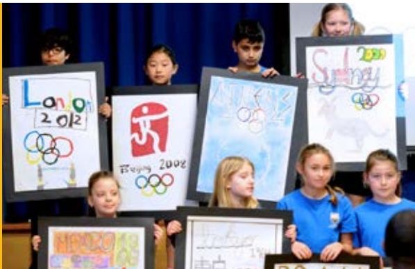
The Junior School has a partnership with the International Olympic Committee and helps pilot IOC educational programs