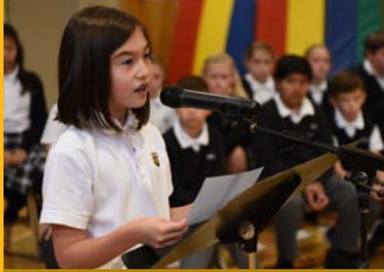
Students are encouraged to express their ideas in different ways, including public speaking