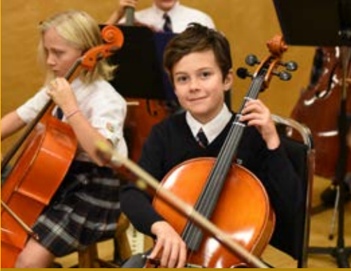
The Junior School strings program teaches skills through ensemble playing