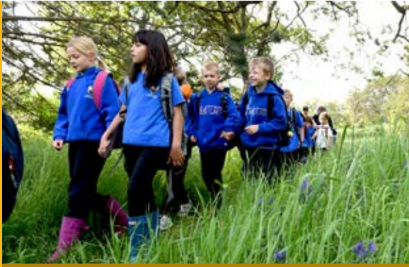
The natural environment is an important classroom at the Junior School