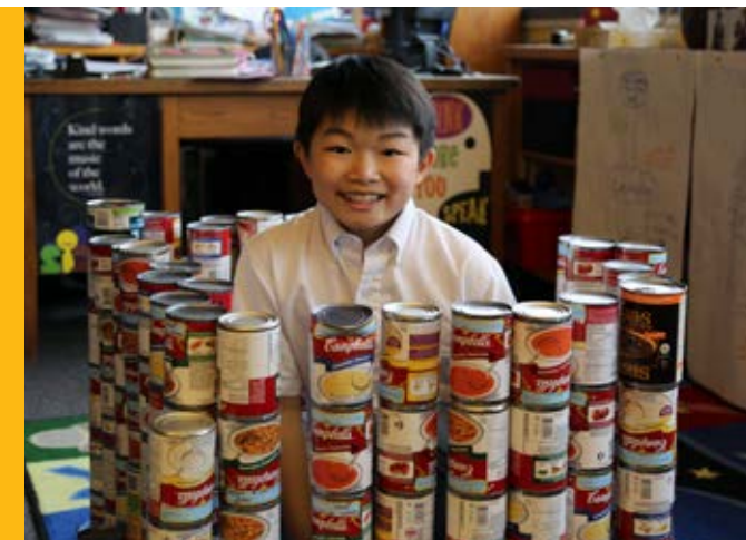
Service programs show students how they can make a difference in their local community and the world

Chapel time at the Junior School is usually centred around a story, most often connected to the virtue of that month. Parents are always welcome to attend.