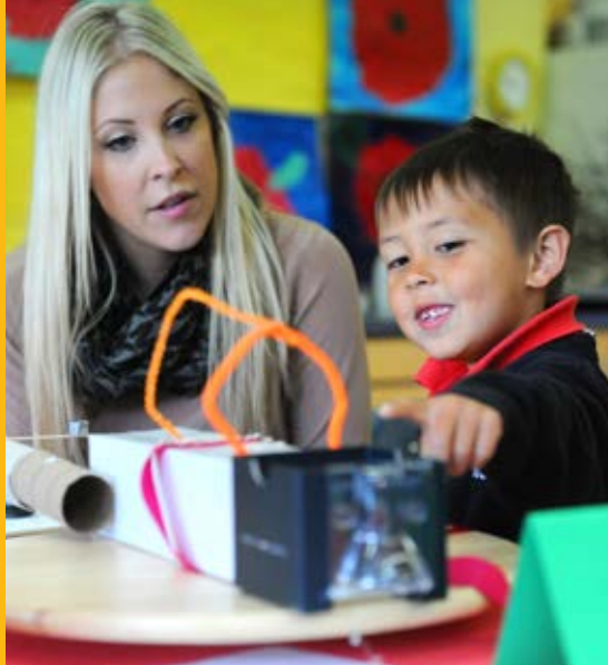
Parents are encouraged to get involved at the Junior School

The first teachers in a child's life are their parents. You play a vital role in your child's success. We want you to be engaged in your child's learning and school life because we all have the same goals for them: to grow, to learn, and to develop a sense of well-being. Research shows that students achieve more academically when their parents are engaged with them at school.