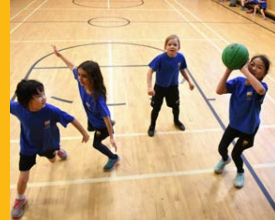
The Junior School provides free Saturday sports activities

Our school really is a family, and our parent community plays a big role in the joy and success of the school. Parents and grandparents are invited to our many community events throughout the year. You are also encouraged to get involved. There are lots of opportunities to help out, including volunteering in the library, helping with costumes, props and sets for our productions, attending field trips, and joining our school welcome committee.